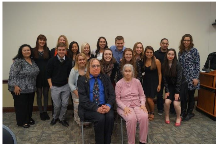
Figure 2. Group picture of the Braille Birds and the two guest speakers.