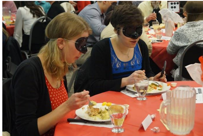
Figure 1. Participants at the Dinner in the Dark. Two women sit at a table. Both of the women have black eye masks on and are eating dinner from a round white plate.