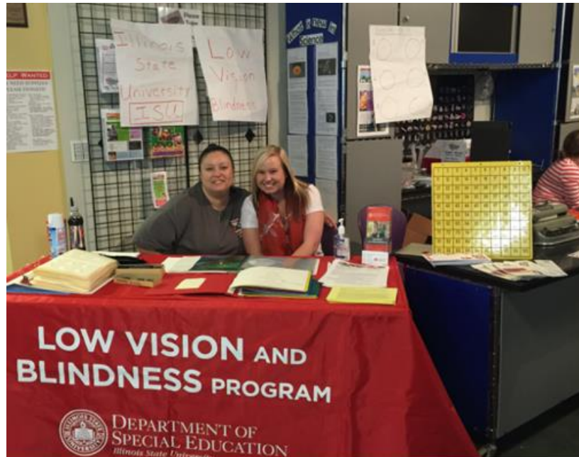
Figure 3. Photo of the LVB and Braille Birds Activity Table at the Children's Discovery Museum in Uptown Normal

On Friday, April 17, 2015 the ISU Braille Birds and the Low Vision and Blindness program were invited to participate in the Children's Discovery Museum's first ever Low-Sensory Family Night. The event was designed for families with children who have autism and other sensory needs. ISU had two tables set up with tactile activities that were completed using blindfolds, tactile dominoes, brailled children books: The Very Hungry Caterpillar and real object activity story books. Participants also had the opportunity to play a game on the braille light board and use a Perkins Braille to braille their name. Participants also walked away with braille alphabet cards and information about our LVB program and Braille Birds organization.